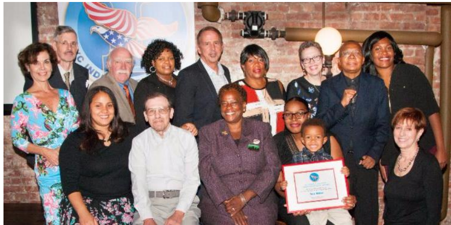
Awardees and presenters