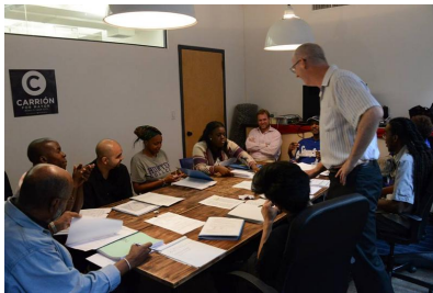
Petitioning training at Carrion Headquarters